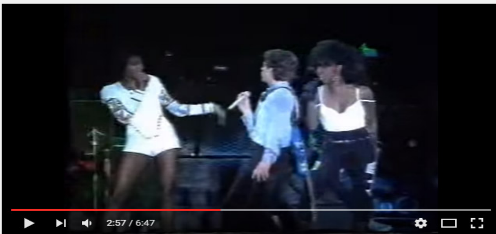
rolling stones miss you live 1990

https://www.youtube.com/watch?v=h56lnD2k5kY