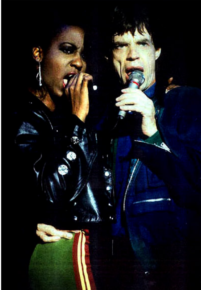
SINGING WITH MICK JAGGER AND THE ROLLING STONES, 1990